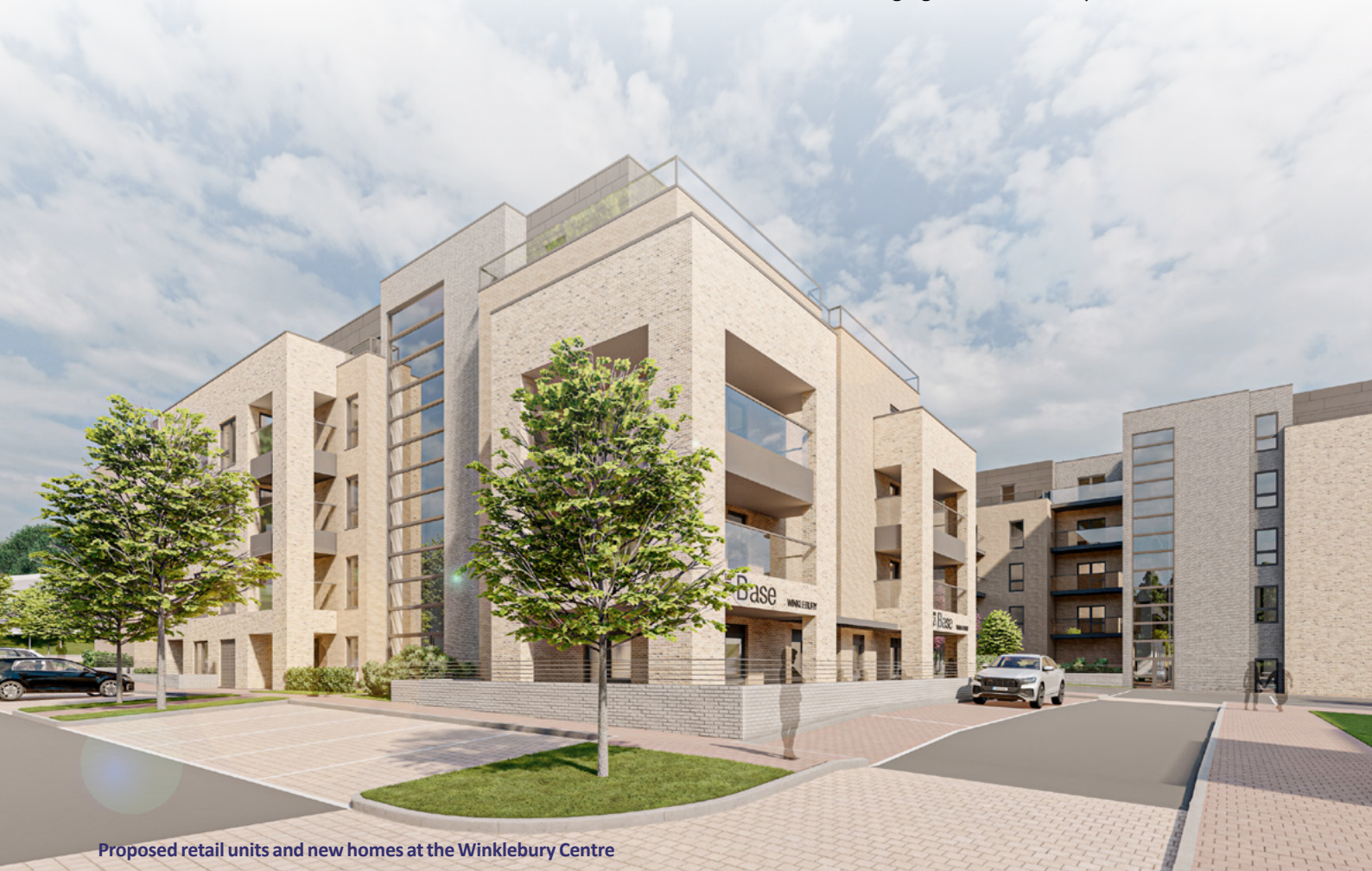
Proposed retail units and new homes at the Winklebury Centre

We have increased parking provision across the site by 23 spaces, taking the total from 346 to 369. The new medical centre will have 8 more spaces from the plans we showed you in June 2021, the preschool an additional 7 spaces and the Winklebury Centre an additional 8 spaces. Parking at the Winklebury Centre will include disabled parking bays and electric vehicle charging facilities for the public to use.