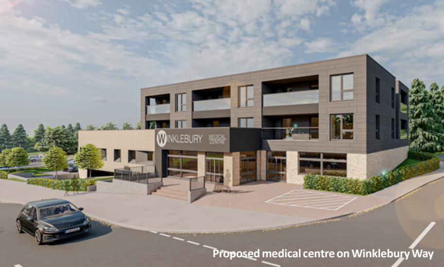
Proposed medical centre on Winklebury Way