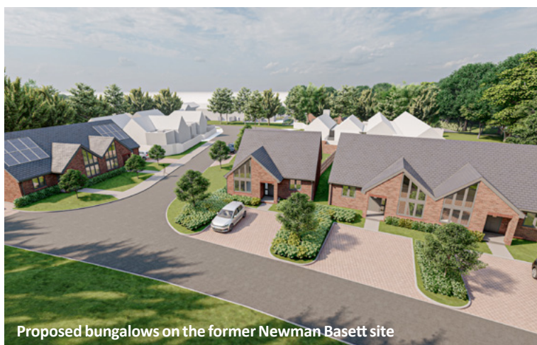
Proposed bungalows on the former Newman Basett site

www.vividhomes.co.uk/about-us/more-homes/developments/winklebury