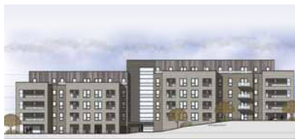
Winklebury Centre East elevation