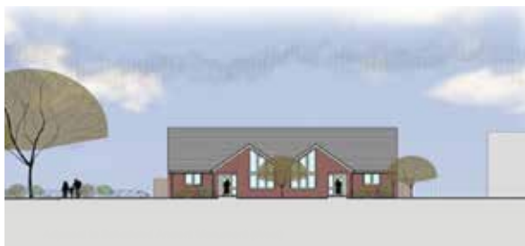
Former Newman Bassett Site